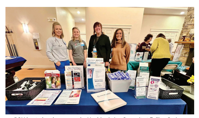
BCH hosted and sponsored a Healthy Aging Summit at Falling Springs Senior Center to bring awareness to new services like outpatient speech therapy and Senior Life Solutions.