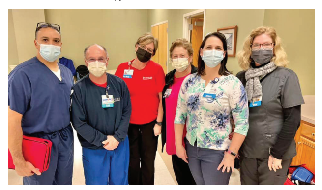
BCH frontline staff taught hands-only CPR and AED demonstrations at Mentors & Meals for young adolescents in Woodford County.